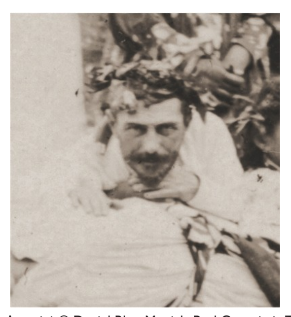
(2) Paul Gauguin in Tahiti, July 19, 1896

The first Agostini album was preempted by the French Government for the MQB, the second – now mine – was allowed to leave the country.