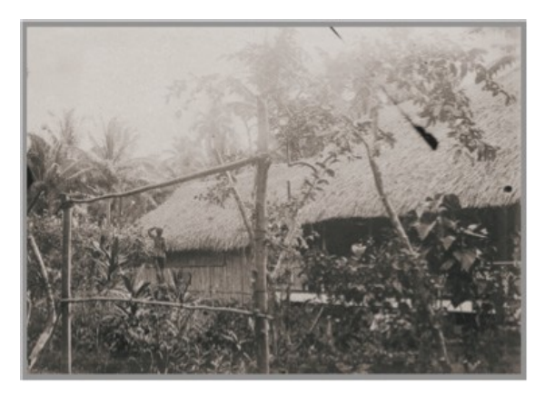
The House of Paul Gauguin in Tahiti, 1896

I knew that "our" photo was in there as well as an additional one showing Gauguin in a different posture, plus the famous one of his house in Tahiti.